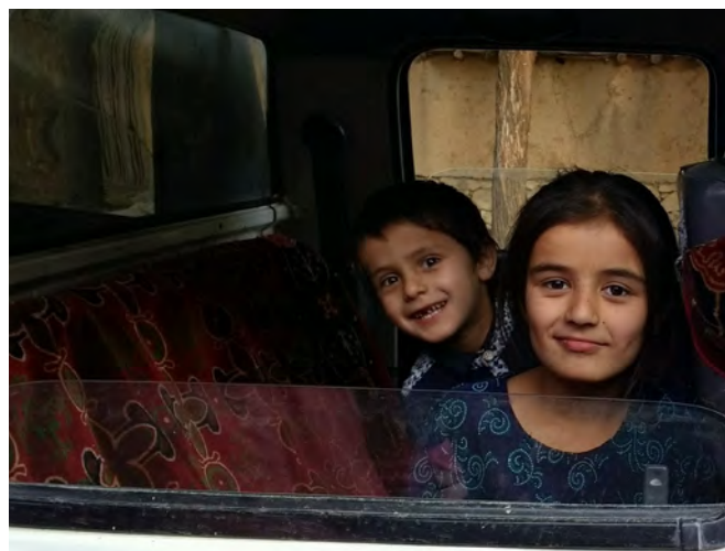
A young boy and girl in Afghanistan.

When analyzing the top 10 Pressure Points for 2021, three words synthesize the characteristic challenges