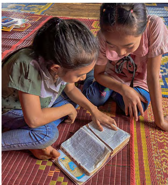
Girls reading the Bible in Laos.