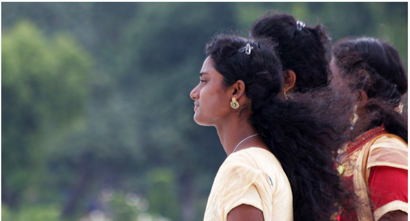
Teenage girls in Northern India.

As seen in Chart 2, Forced marriage and Violence - sexual were the two most widely reported Pressure Points for girls across the WWL 2021 top 50 countries. Affiliated Pressure Points such as Abduction, Trafficking and Targeted seduction also contribute to a pattern of targeting girls for their sexual purity and marriageability. Girls are usually fully dependent on family for financial and physical security and thus highly vulnerable should persecution come from within their family unit; escape is rarely an option.