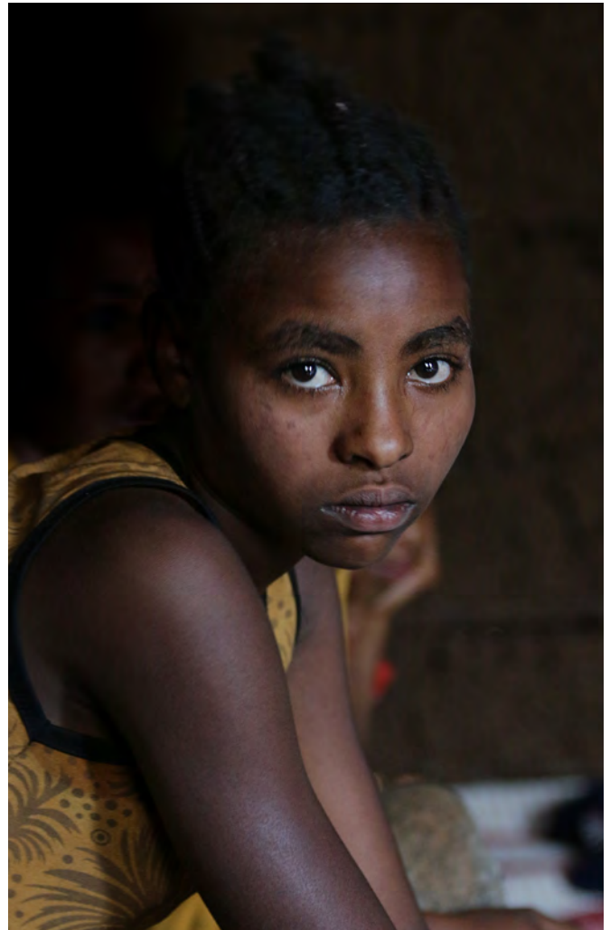
Eldest daughter of widowed and destitute Christian mother, southern Ethiopia.

Government armies, militias and criminal groups exploit Christian children and youth in conflict zones as commodities. They are shaped into child soldiers ( see page 10: Gender and CSRP-YSRP ), or bought and sold as products trafficked for