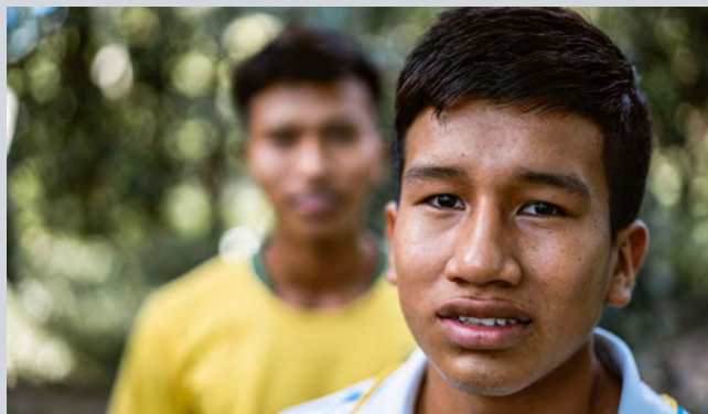
Young boys from the Nasa-Páez indigenous community in Colombia.

When a child's path for education is restricted, it statistically leads to reduced socio-economic status. 49 As noted above in Spotlight: Education (see page 8), such restricted paths often lead to other vulnerabilities such as child marriage, trafficking and physical violence.