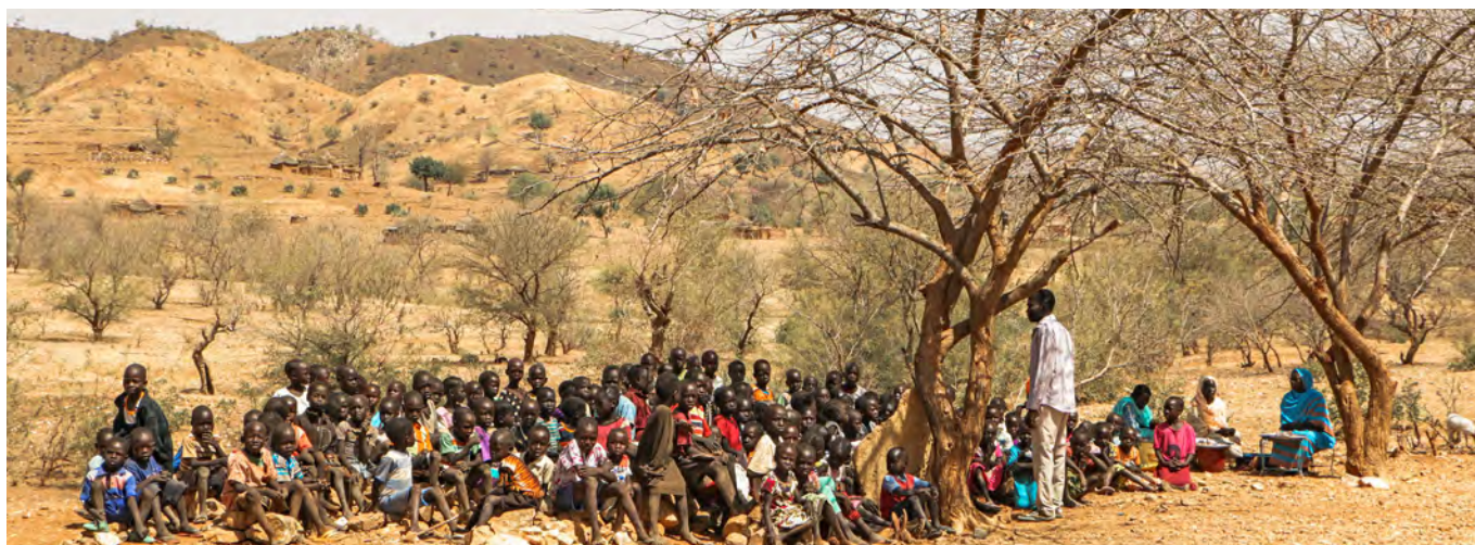
A class of students in Sudan.

a parent's Christian conversion, courts may automatically take away custody of children based solely on a parent's faith. Alternatively, extended families remove children from Christian parents, a practice accepted by communities due to embedded social norms. Courts can exert further power over Christian parents: similar to the administrative challenges churches face in the region, Christian parents with an Islamic background can often struggle to register children. 21 Chart 1 shows this in the high percentages for Denied access to a Christian parent and Denied legal identity as a Christian.