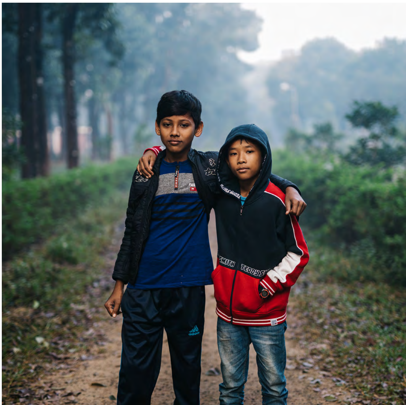
Christian boys of Muslim background in Bangladesh.

in many countries where Christians are persecuted, with persecuting actors ranging from family members to peers to violent groups. Generally, this is motivated by those of majority religions or ideologies aiming to pressurize conversion, either to put pressure on relations, or using violence as a response to the rejection of the majority religion or belief. Yet sometimes there are specific triggers for violence, as in parts of Syria and Egypt, where witnesses reported that perceived immorality in the way Christian girls dress results in physical abuse. More commonly, the trigger is the refusal to renounce their faith or participate in the activities of violent groups.