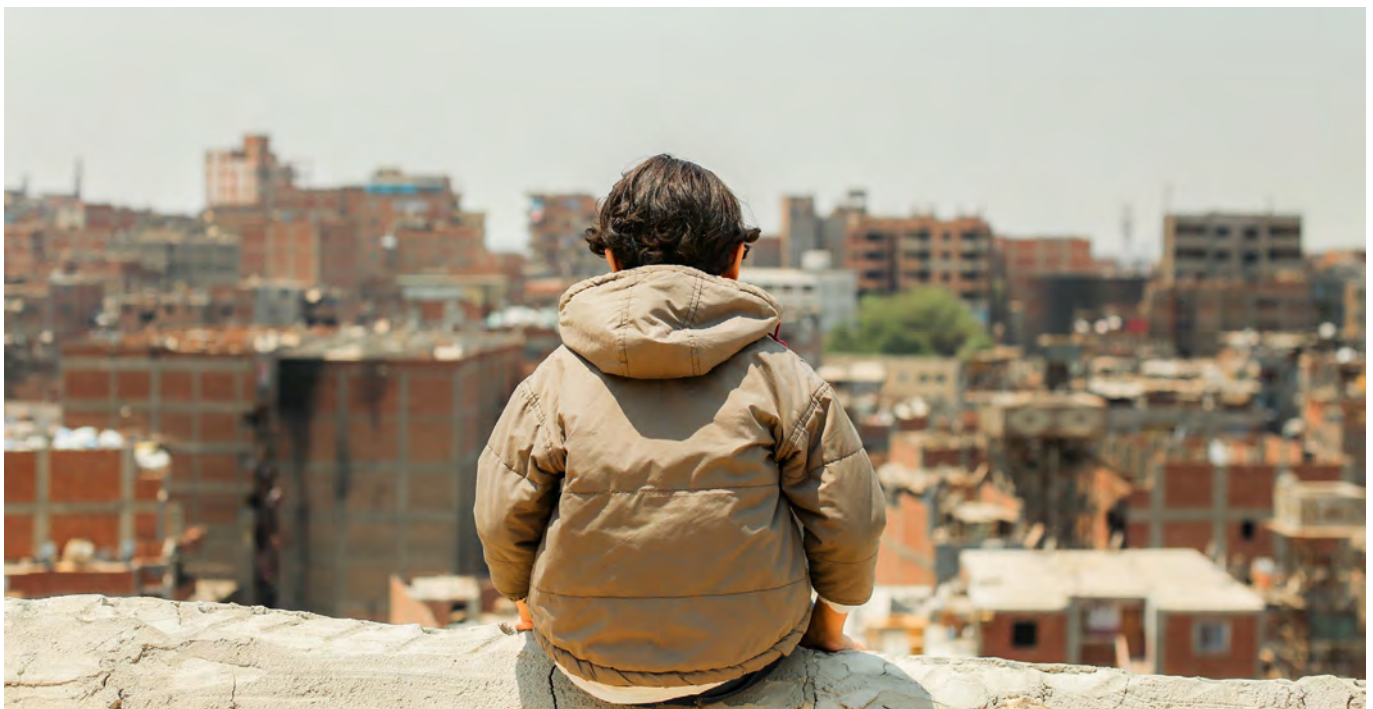
A young Egyptian boy watching over his city.

Recognizing the end goals of CSRP-YSRP and the risks can encourage LFAs and policy makers to work together to ensure the broadest space of religious freedom for children and youth as they grow into their own unique spirituality. Policy makers can ensure that the intersection of children’s rights with religious faith (or belonging to a family with religious faith) is recognized as an additional vulnerability. Together, adults committed to religious freedom can work to preserve the opportunity for children and youth to learn and grow in the faith of their parents and the child’s right to and developing capacity to explore freedom of religion or belief.