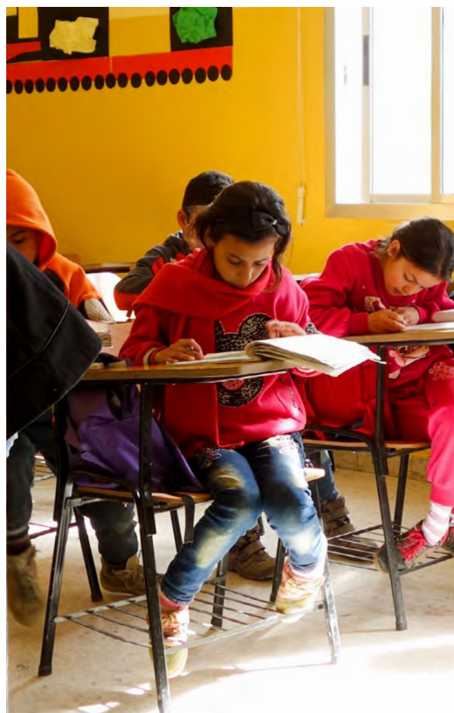
Class with Syrian children.

Four of the associated Pressure Points comprise different forms of violence (verbal, sexual, physical, and psychological) in addition to the discrimination inherent in Denied access to social community/ networks (children and youth shunned by classmates). Education has the power and potential to create cultures of tolerance and understanding, but equally, can “fuel stereotyping, animosity” and “entrench disadvantage”. 30 Carried out primarily by peers and teachers, an enabling environment often ignores, or worse, actively encourages such activities. Harassment of Christians may be seen as legitimate or even unremarkable, and so, these Pressure Points can be carried out with relative impunity.