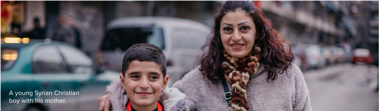
A young Syrian Christian boy with his mother.

Many other religious minorities face various levels of persecution including Shia, Alewite, Druze, Jews, Yazidis, and Zaradashtis. Shia, Alewite, and Druze communities have been marginalized and persecuted by Sunni jihadists, not only on the grounds of their faith being considered heretical but, in the case of the Alewites, also because of their perceived connections with the respective Assad presidents. Yazidis and Zaradashtis belong to Kurdish religions, which are not recognized by the Syrian regime. Their children are registered as Sunni Muslims and they learn Islam in school.