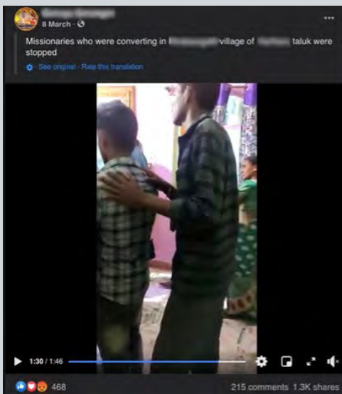
Image refers to background of anti-Christian persecution in Case Study 1. The image is sourced from the website The News Minute.com, available at: https://www.thenewsminute.com/article/bengaluru-christian-community-alleges-local-officials-removed-jesus-statue-without-cause . Copyright information about this image is unknown.